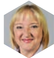
June Hitchen MP & NH